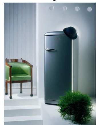
Gorenje Old Timer, 1999

Each of the styles features select colours and various combinations of the refrigerator and freezer compartment. These appliances address the customers with a refined taste who dare to introduce their own lifestyle into the kitchen. The new collection was designed at Gorenje to celebrate the anniversary of launching the first Old Timer fridge freezer a decade ago; the refrigerator proved a real sales hit. Topping the list by popularity was the cult single door retro refrigerator with a special low-temperature compartment, while Bordeaux red and beige have been the most charming colours to date. A few years ago, the refrigerator design was freshened up by a new handle; reacting to the huge popularity among the customers, Gorenje now decided to expand the colour palette.